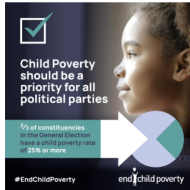
Percentage of constituencies with a child poverty rate of at least 25%