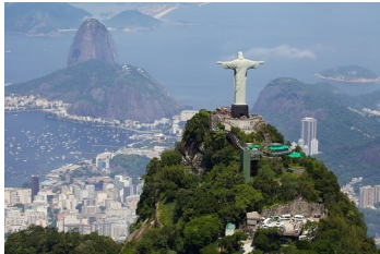
Christ the Redeemer