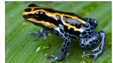
Poisonous dart frog